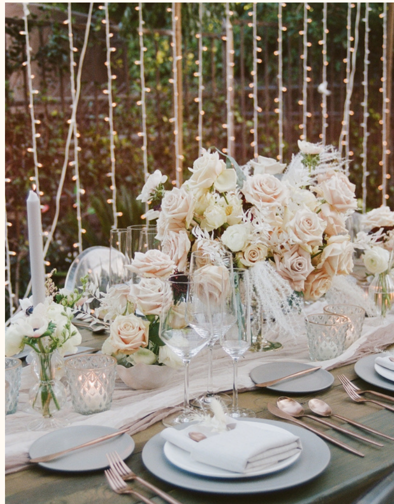
Furniture, Lighting & A/V Rentals