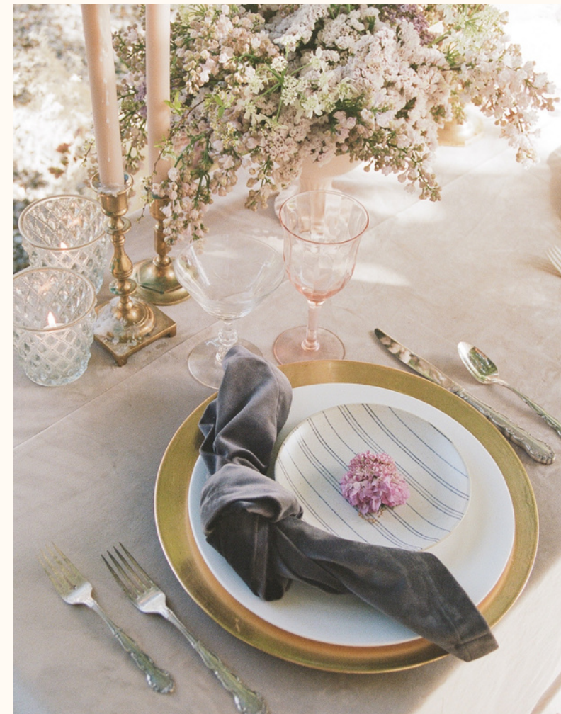
Catering / Bar